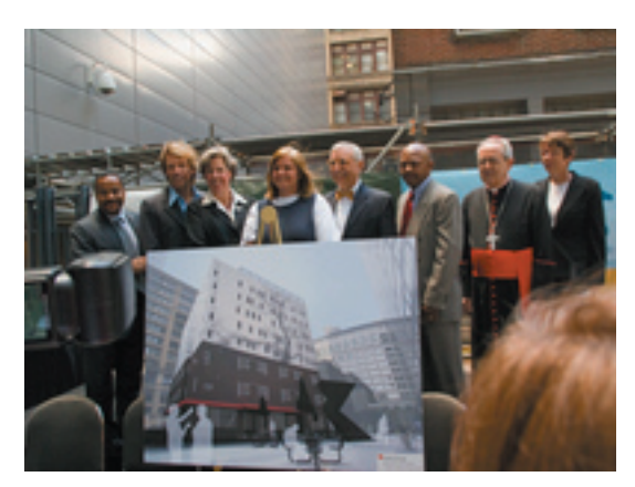
Groundbreaking ceremony for Connelly House

Project H.O.M.E. and Bethesda Project received Housing Trust Fund support for the development of the Connelly House, which provides 79 units of permanent affordable housing for formerly homeless men and women in Center City Philadelphia. Connelly House replaces an underutilized building and provides office space for Bethesda Project.