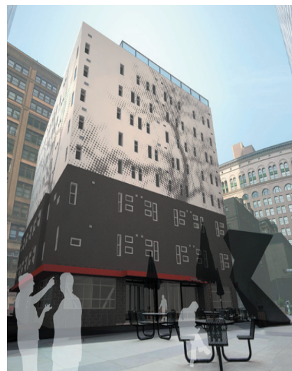
Rendering of Connelly House