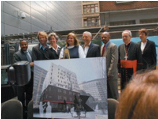
Groundbreaking ceremony for Connelly House

Project H.O.M.E. and Bethesda Project received Housing Trust Fund support for the development of the Connelly House, which provides 79 units of permanent affordable housing for formerly homeless men and women in Center City Philadelphia. Connelly House replaces an under-utilized building and provides office space for Bethesda Project.