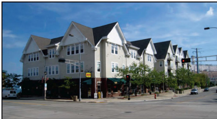
Mixed use (retail, office, and residential) development in the City of Port Washington : SEWRPC

Cities and villages should consider extending the life of Tax Increment Financing districts for one year after paying the district's projected costs to improve the municipality's affordable housing stock, as permitted under a recent change to State law.