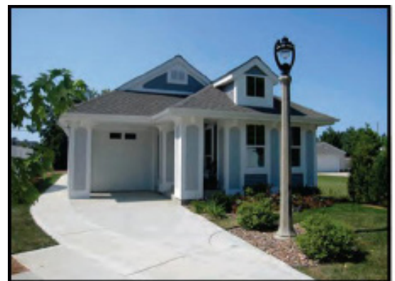
New single-family home on an in-fill lot in the Village of Mt. Pleasant: SEWRPC