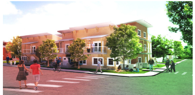
Moylan Terrace is a new planned development of townhomes. The initial phase contains twelve townhomes in San Luis Obispo.

Since closing its first loan in 2005, the Housing Trust Fund has provided more than $8 million in financing to assist 225 units of affordable housing.